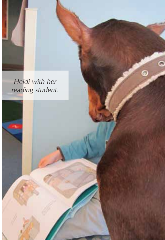
Heidi with her reading student.

Mom parks the car at Bellview Elementary School in Ashland, Oregon, where I work as a Reading Dog. This was her school, and now it is mine. I have worked here for many years and have helped over thirty students. I work with the challenging ones...kids who are smart and can read but have had bad experiences in their life and have difficulty behaving. In the last 6 years I have loved the kids that are tough to love. I look deep in their eyes, and I know they have many secrets that I can feel. They touch my head, and I know they feel safe and loved with me. They know I